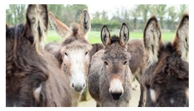
and you will be fine.