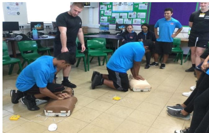
(photos above of Secondary delivering First Aid with HW Training Services)